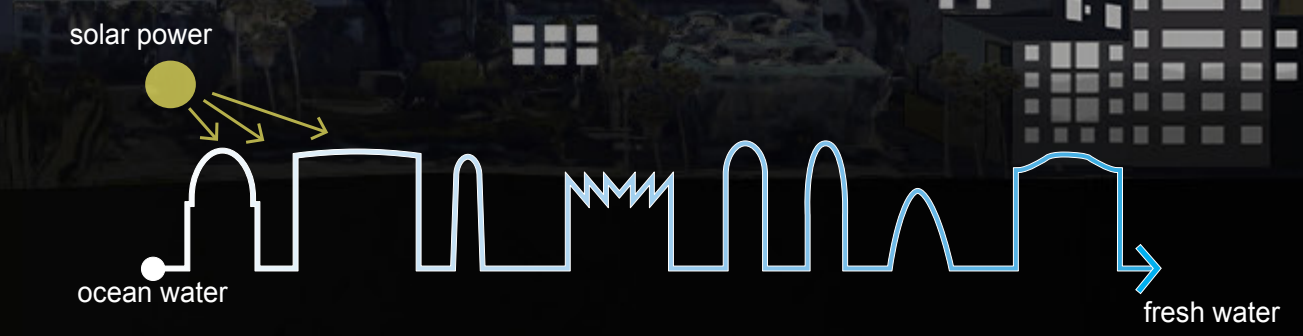
Passive desalination with solar power