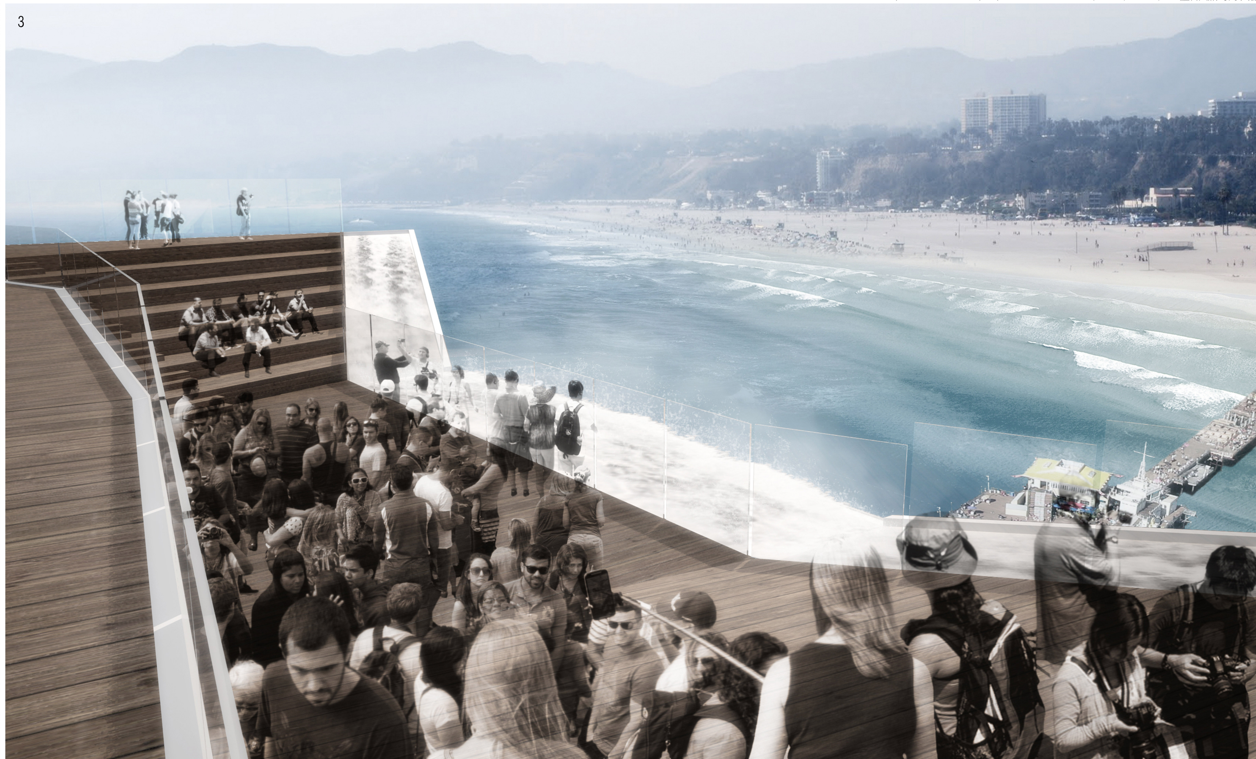
1. LOWER DECK - WATER MIST ADVENTURE