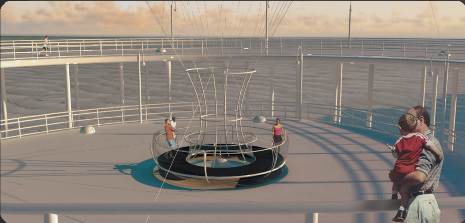
THE OBSERVATION PLATFORM OFFERS AN IDEAL VIEW OF THE BALLOON AND BEYOND

IMAGINE EXPERIENCING SANTA MONICA FROM DRAMATIC NEW HEIGHTS. HIGH ABOVE THE BUSTLING HISTORIC PIER, BIG BEACH BALLOON GENTLY CARRIES EXCITED PASSENGERS SKYWARD. BY CONNECTING THE PIER'S AMUSEMENT PARK CHARACTER BELOW WITH SPECTACULAR PANORAMIC AERIAL VIEWS ABOVE, THE DESIGN AIMS TO CELEBRATE SANTA MONICA'S BLESSED LOCATION, WHILE SEAMLESSLY HARNESSING ONE OF ITS MOST ABUNDANT RESOURCES . . . THE SUN.