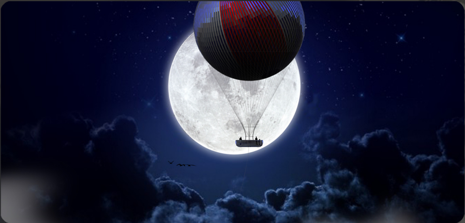
ADMIRING THE SUN'S REFLECTED LIGHT AFTER DARK