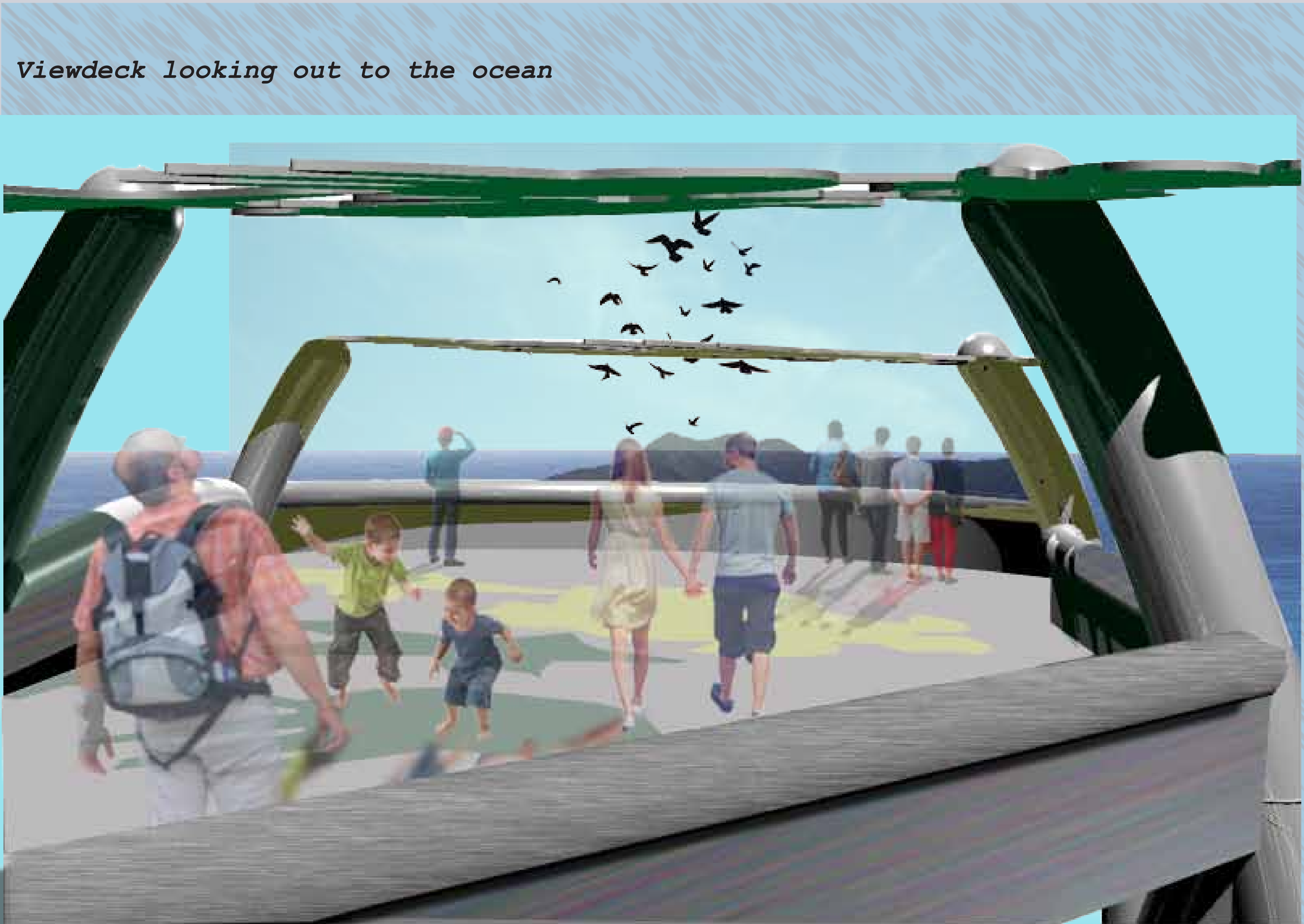
Viewdeck looking out to the ocean