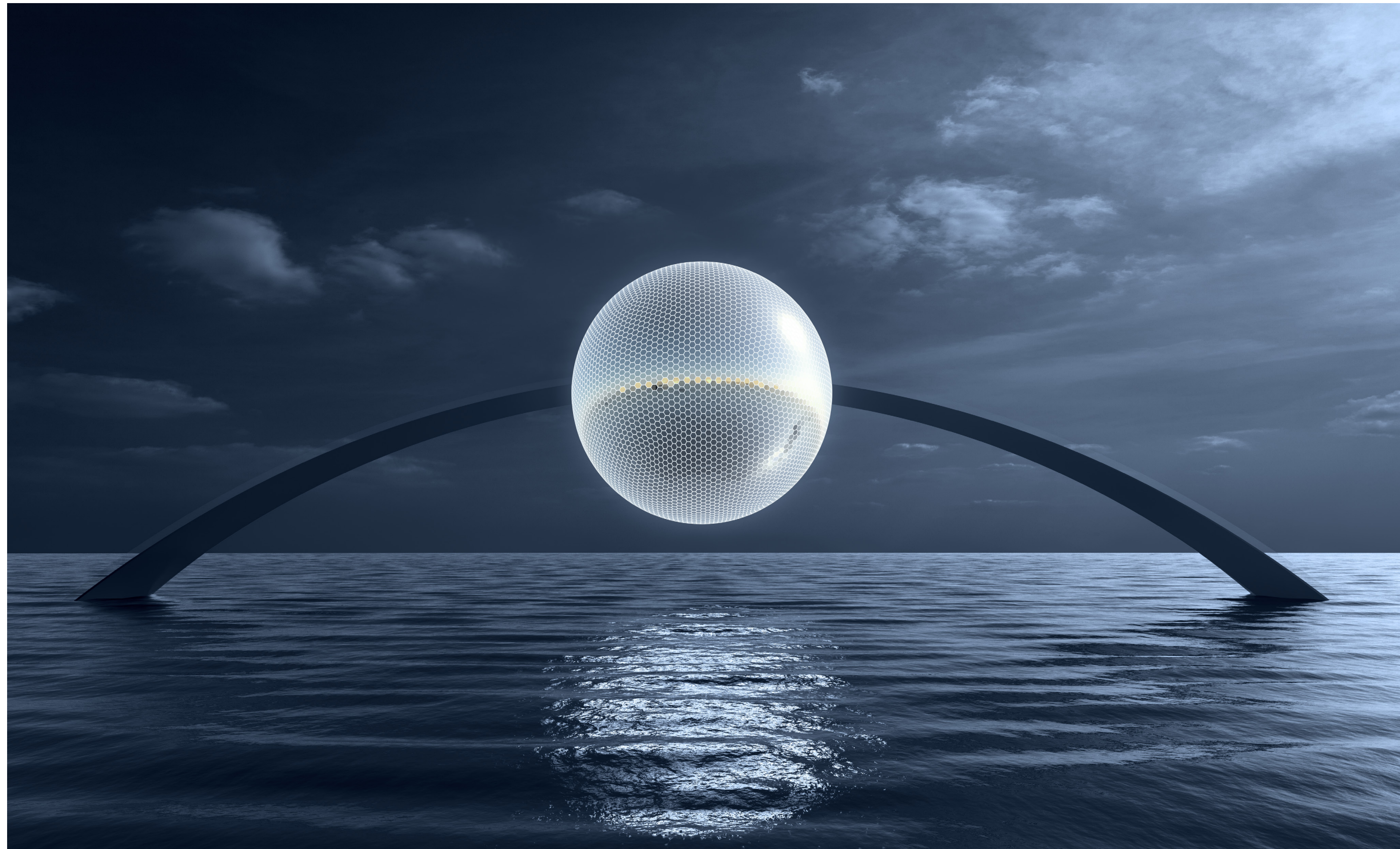
During the night the "Light Drop" becomes a sort of lighthouse with a computer-controlled display.