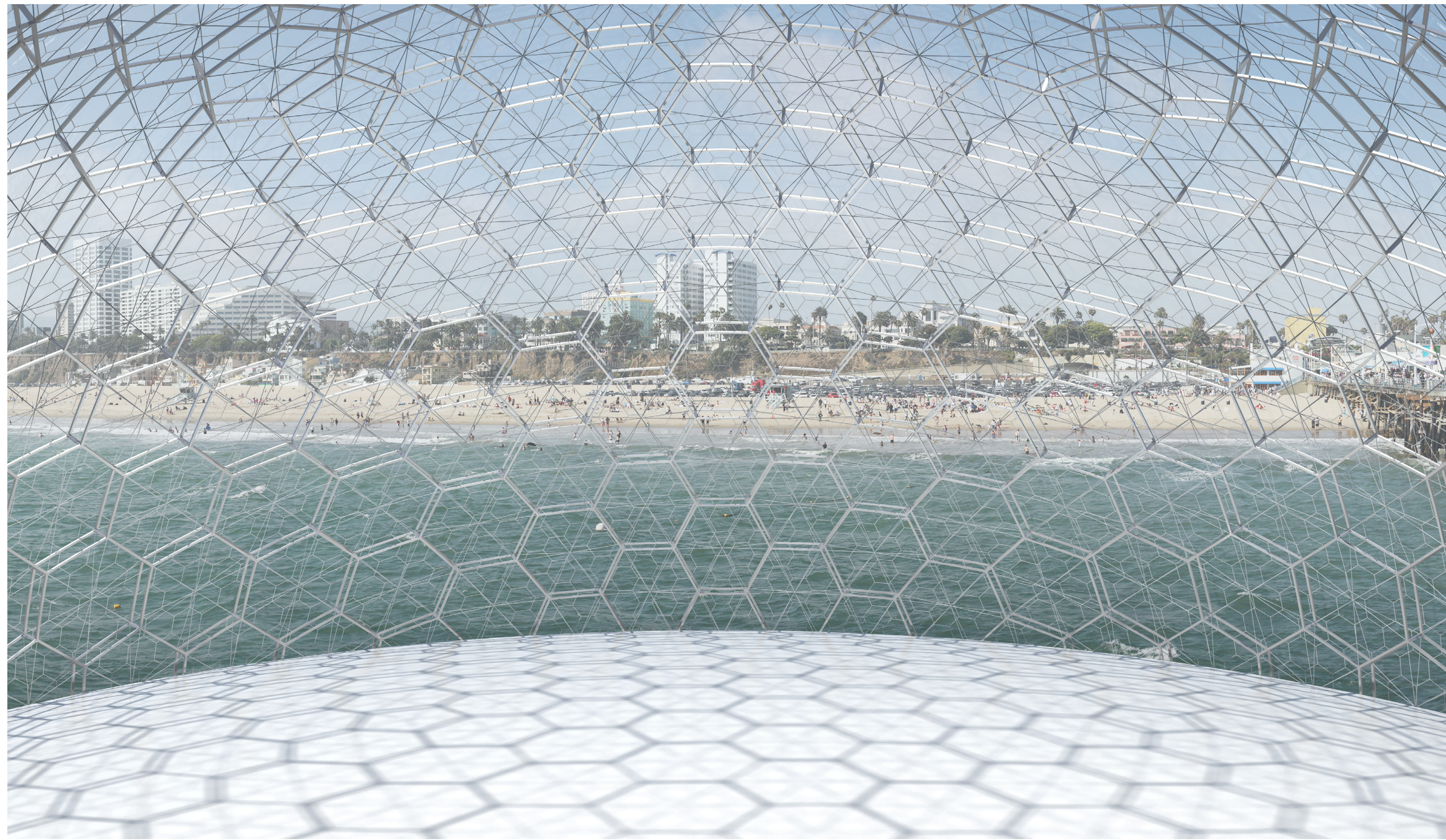
The "Drop" houses a public panoramic space, a dome-shaped observatory with a 360-degrees view.