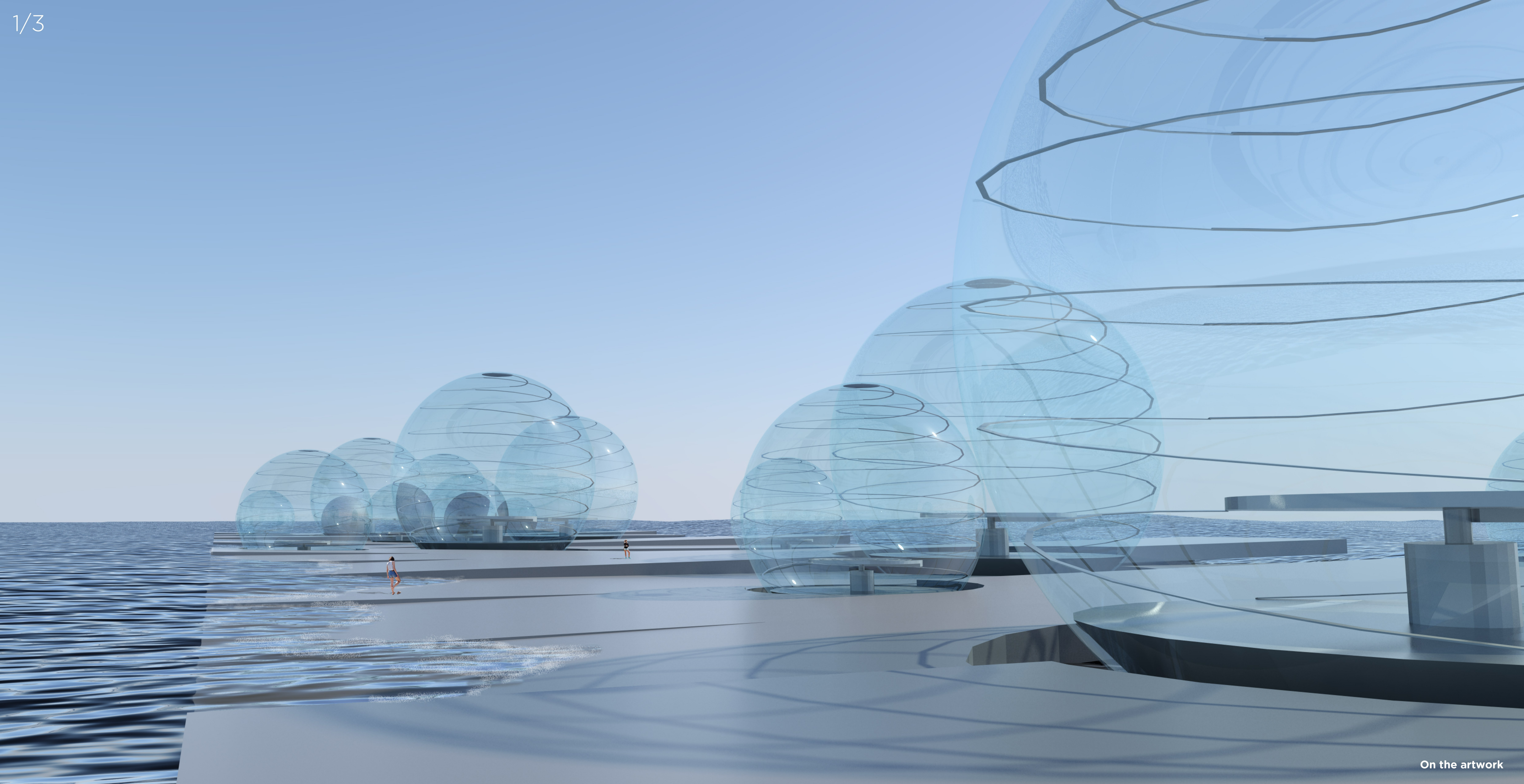
On the artwork