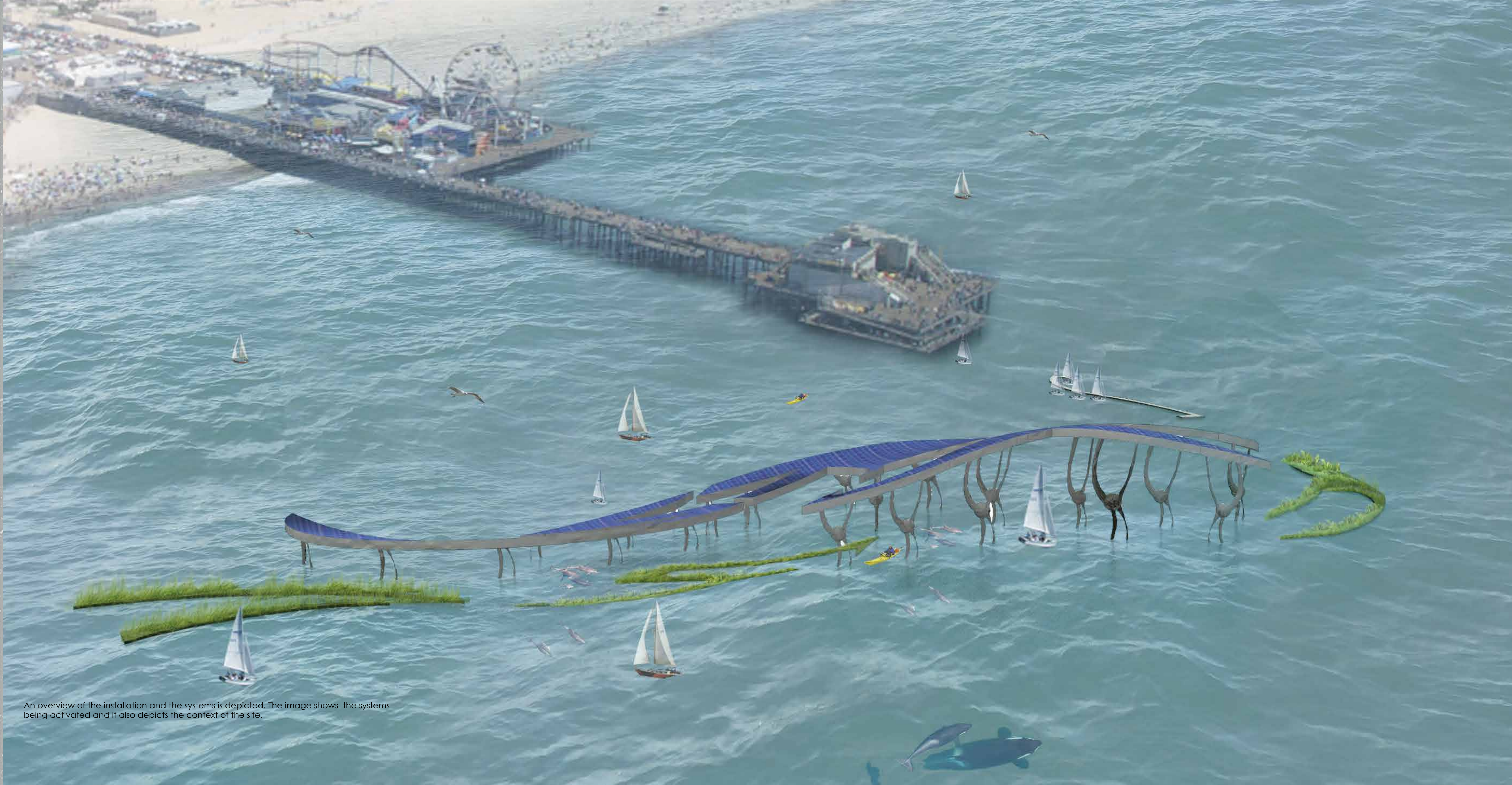
An overview of the installation and the systems is depicted. The image shows the systems being activated and it also depicts the context of the site.